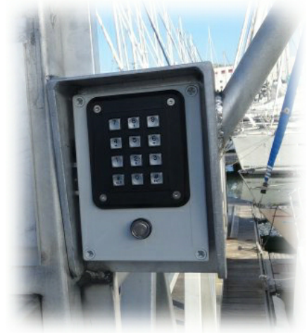
VERSION LECTEUR IBUTTON