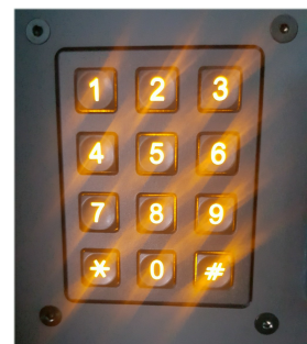
VERSION CLAVIER RÉTRO-ECLAIRE

FIXATION PAR 4 TROUS (3 mm) 113 mm x 163 mm (entre axe)